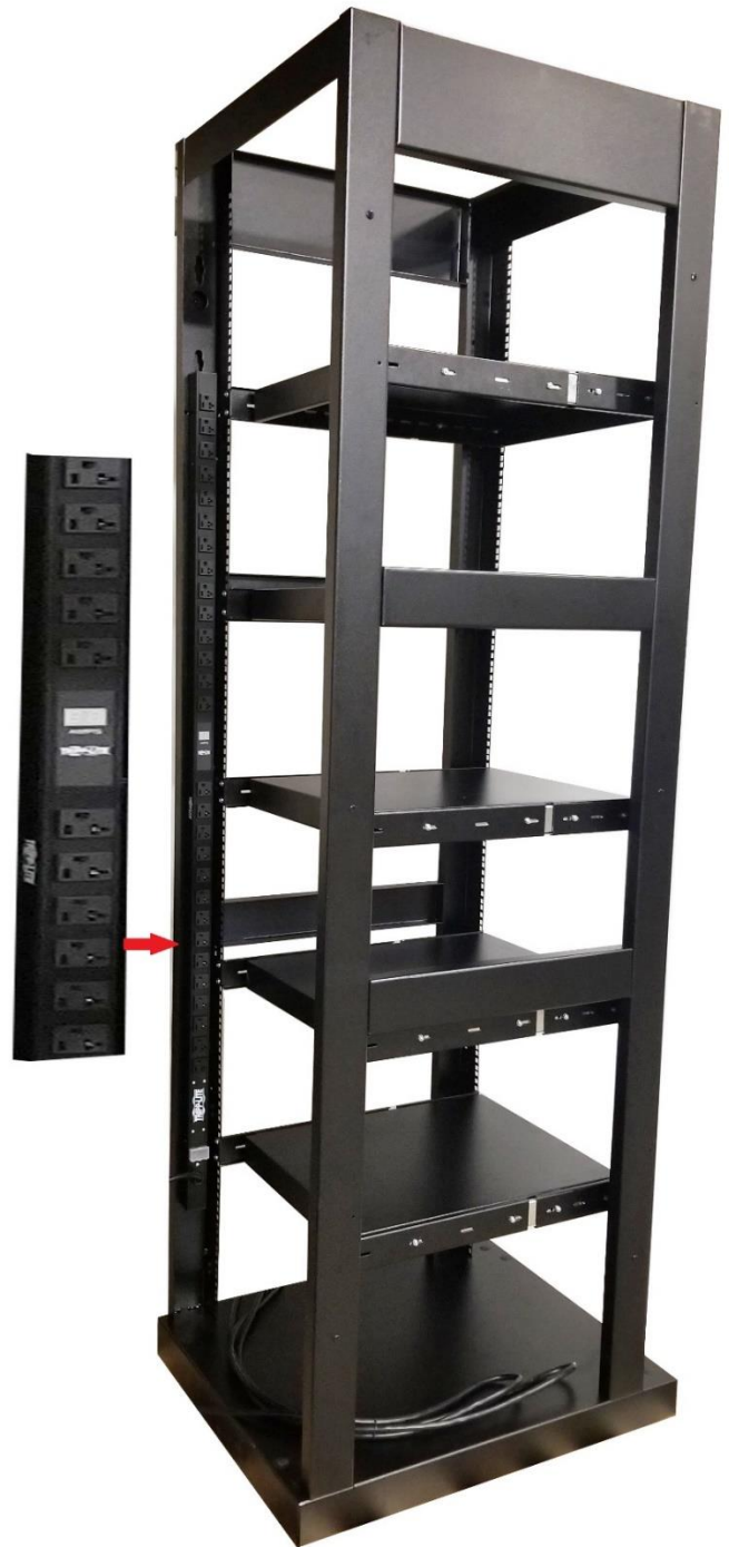
Rear View of the cabinet