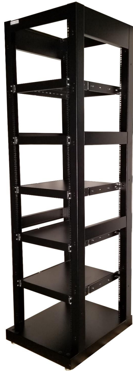
Front View of the cabinet