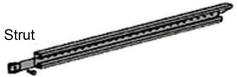
Optional Mounting System Strut

The strut is fixed to the existing wall, allowing the swing-out relay racks to be bolted to the strut at the required location. The strut is supplied with the hardware.