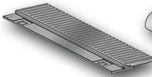
Brush-8: Brush infill restricts airflow and allows cable entry